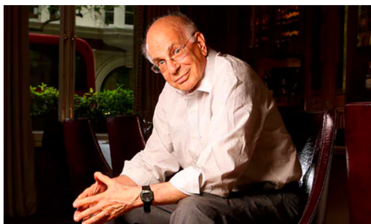
Governments' current favourite psychologist, Daniel Kahneman.

Speaking in Athens last November, the Italian philosopher Giorgio Agamben discussed an epochal transformation in the idea of government, "whereby the traditional hierarchical relation between causes and effects is inverted, so that, instead of governing the causes - a difficult and expensive undertaking - governments simply try to govern the effects".