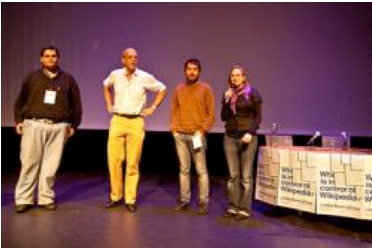
More pictures on Flickr.