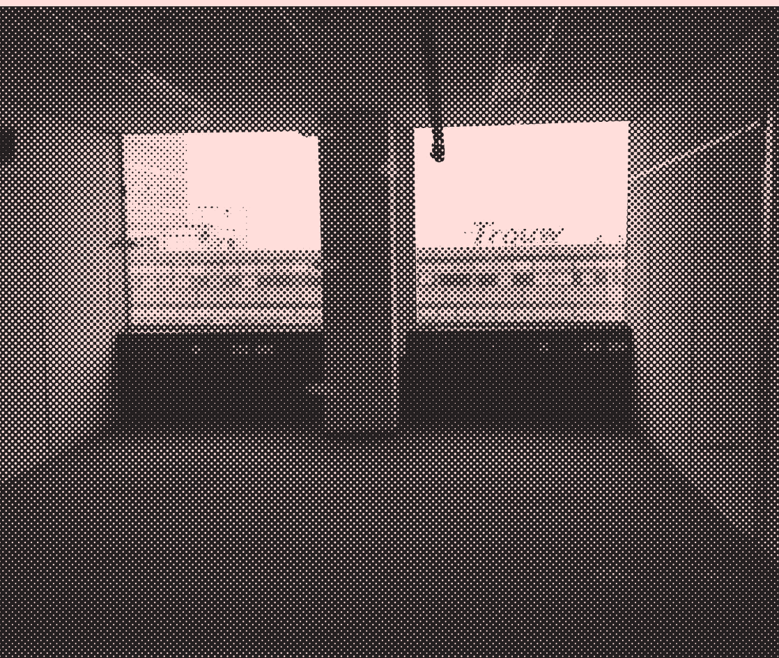
The sign of night club Trouw through the window of an empty studio as tenants were moving out.