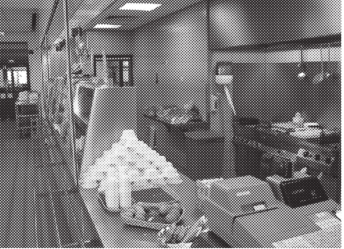
The staff restaurant on the top floor as photographed during one of Urban Resort's exploratory visits to the building in 2007.