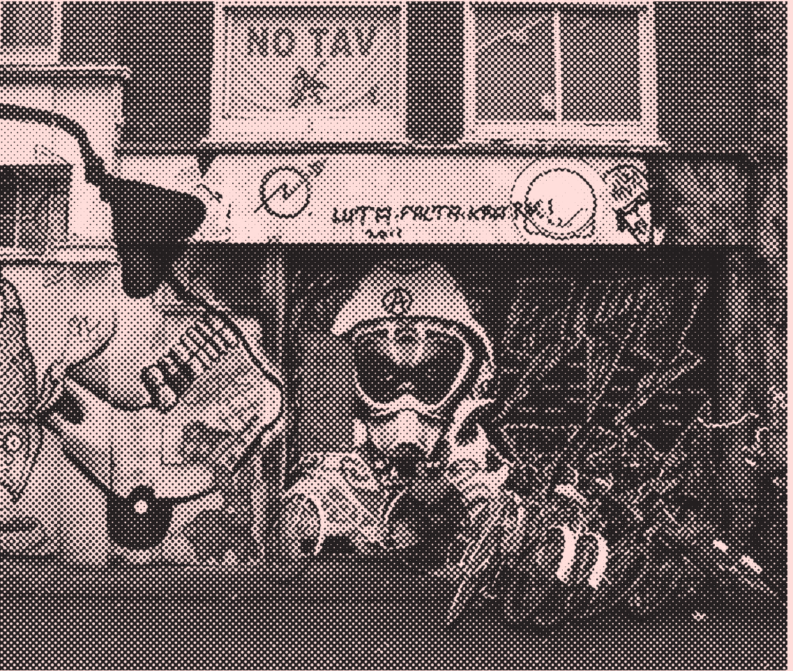
One of the remaining squats in the Spuistraat, situated in the city center of Amsterdam.