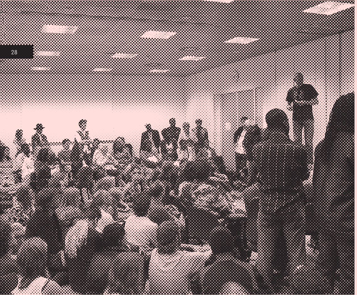
People interested in renting a studio come listen to Jaap Draaisma during an open night.