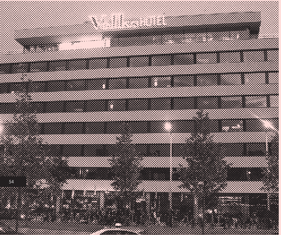
The building on the night of its opening as the Volkshotel.