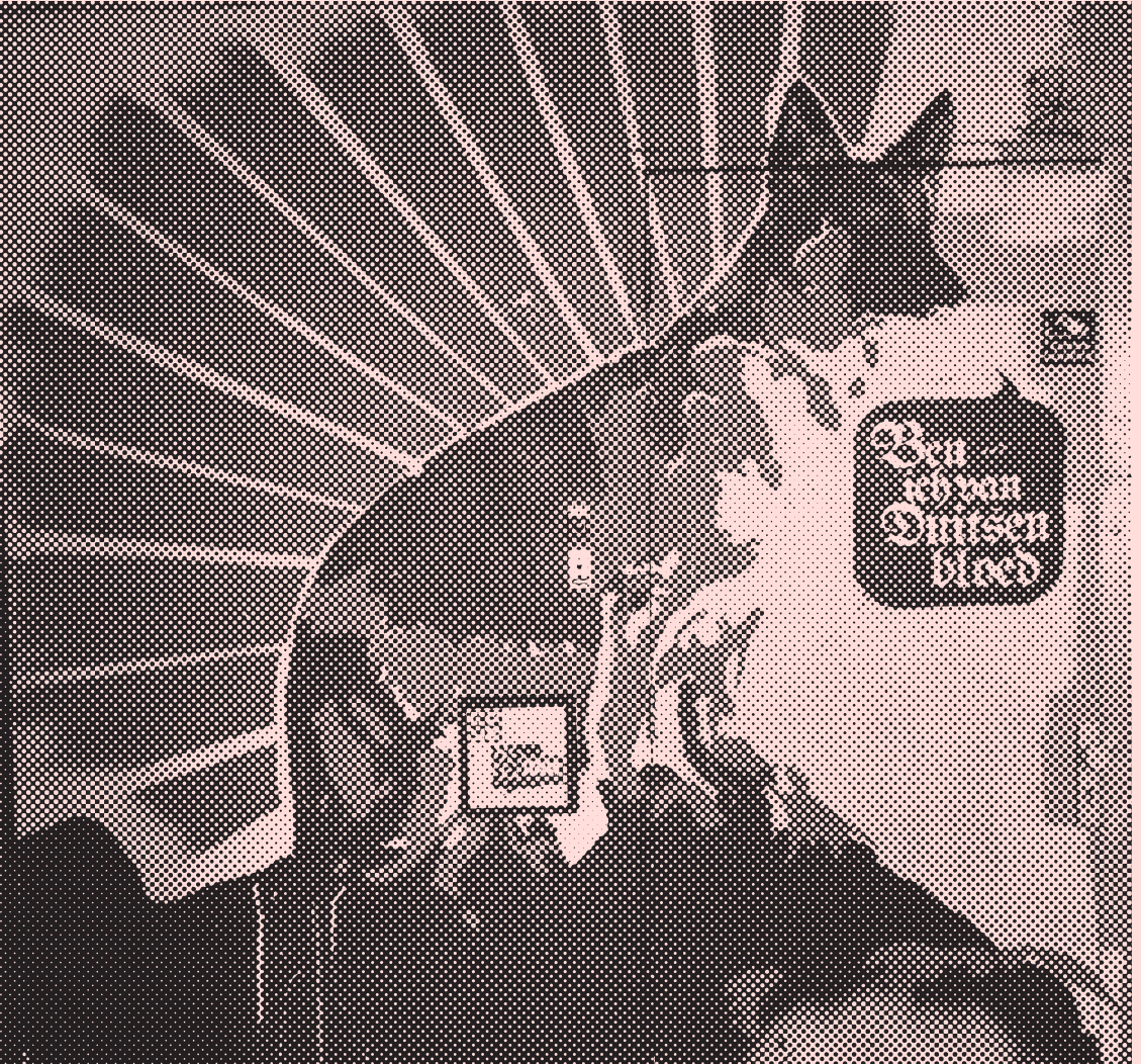
The entrance to the fifth floor of the art factory in the former Volkskrant building, built and painted by the tenants of this floor.