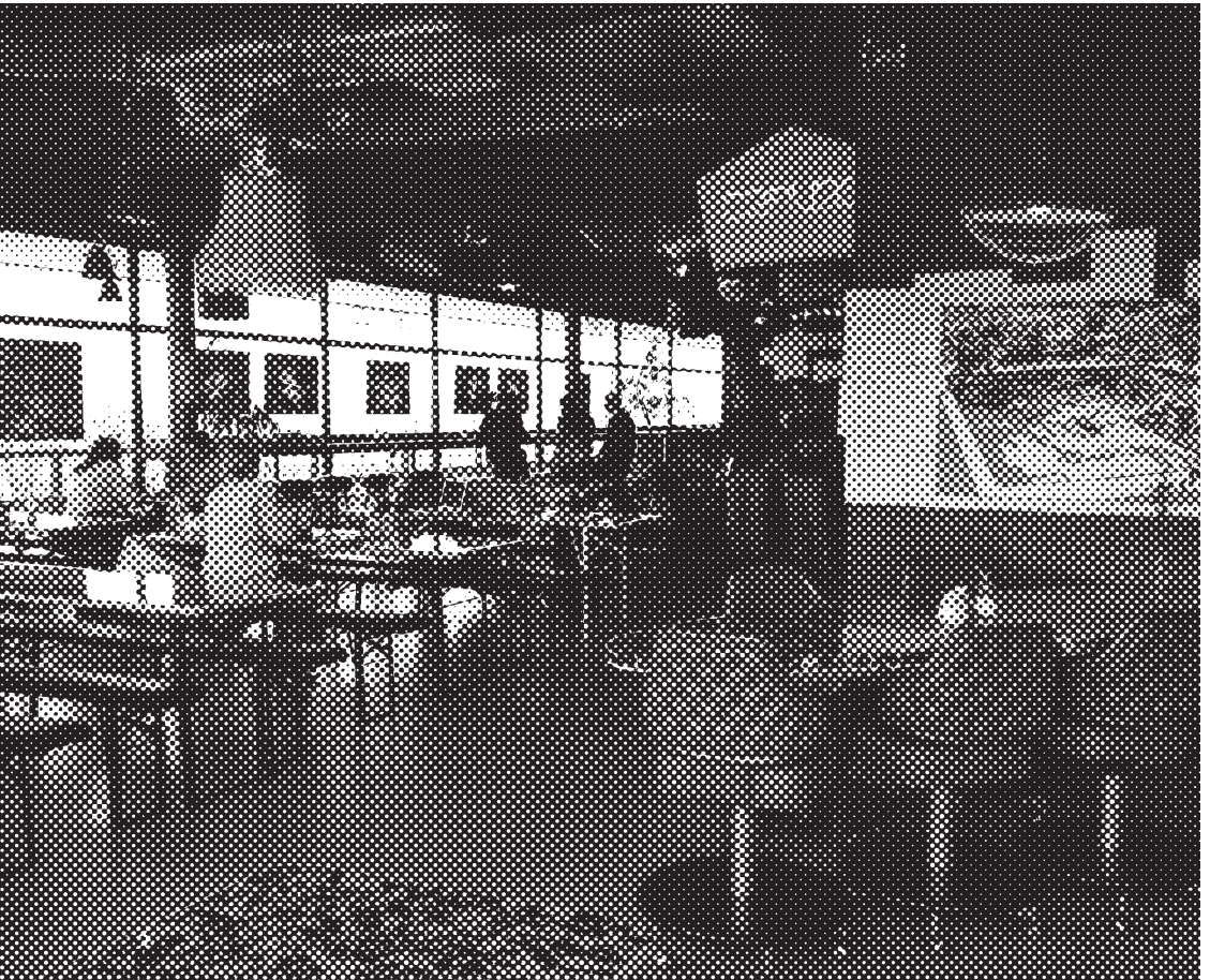
Canvas as it looked throughout 2012 and 2013.